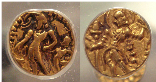
Gold coins from Chandragupta II

By this point in time, the diverse array of philosophical insights which had emerged in prior ages began to coalesce into various schools of thought. Six of these schools of thought (darshanas) are the most well known. They are Nyaya, Vaisheshika, Sankhya, Yoga, Mimamsa, and Vedanta. Each has its own a unique perspective on cosmology, the nature of God, the universe, and the soul. In addition to purely theological questions, these darshanas addressed issues spanning the breadth of secular philosophy. Mimamsa explored ethics and philosophy of language. Nyaya and Vaisheshika explored logic in the conceptual and physical worlds respectively. Samkhya explored the relationship between spirit and matter, which influenced the meditative practices pioneered by the Yoga school. Of all the Darshanas, Vedanta, or the elaboration of Upanishadic philosophy has perhaps been the most influential on modern Hinduism.