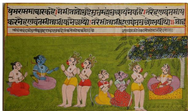
A painting depicting a scene from the Ramayana.

Over hundreds of years within this period, the epic poems called the Ramayana and Mahabharata (which includes the Bhagavad Gita) were composed. These texts focused largely on dharma, or righteous conduct, often in morally uncertain circumstances. Devotionalism, or bhakti , starts in the Puranas. The Puranas contain complex stories and introduce new deities such as Ganesha, the Remover of Obstacles, Skanda, the God of War,